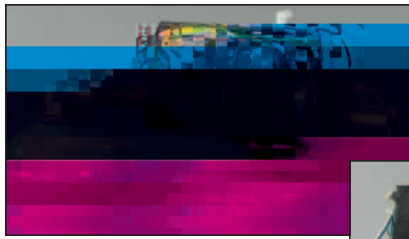
Front (without cover) ◀